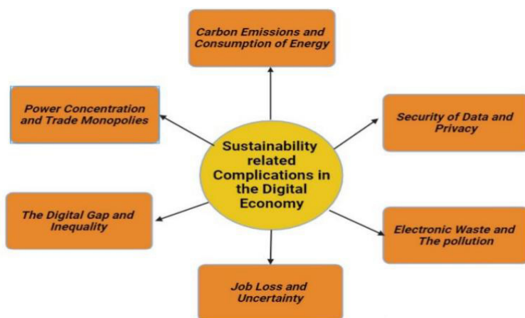
Figure 1. Digital technologies and sustainable development [15]

Today, green digital transformation involves the use of advanced digital technologies – such as artificial intelligence (AI), the Internet of Things (IoT), blockchain and